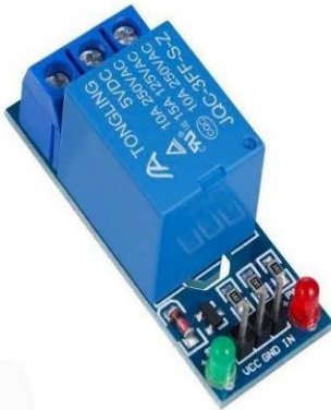
Fig 4. Relay Module

A relay module is a fundamental electronic component that facilitates the integration of low voltage microcontrollers with high-voltage electrical devices. Central to its functionality is the relay, an electromagnetic switch consisting of a coil and contacts. The relay module acts as an interface, allowing a microcontroller, such as those used in Arduino projects, to control devices with different power requirements. The module typically includes input terminals for connecting to the microcontroller, power supply terminals for the relay coil, and output contacts to control external loads.