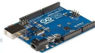
Fig 2. Arduino Uno

Arduino Uno is a microcontroller board based on the ATmega328. It has 14 digital input/output pins (which 6 can be used as PWM outputs), 6 analog pins, 16MHz ceramic resonator. USB connections, power jack, ICSP plug, and a reset button. It contains everything needed to support the microcontroller, simply use the USB cable or power it with an AC-to-DC adapter or battery is connected to a computer begins.